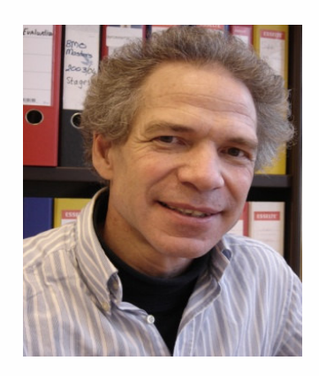
Prof.dr. Tjard de Cock Buning Policy